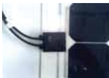
CONNECTION: JUNCTION BOX