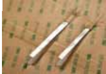
CONNECTION: SOLDERING RIBBON