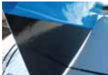
FIXING: DOUBLE SIDED TAPE