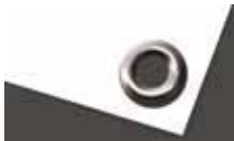
FIXING: STAINLESS STEEL EYELETS