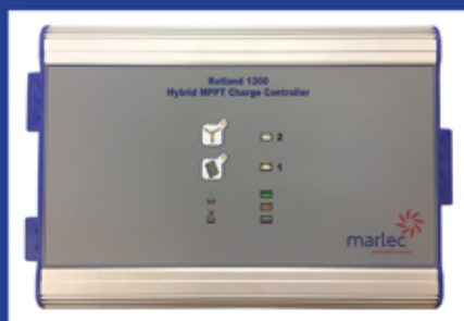
Dims: 258x164x68mm 1.3kg 10x6½x2¾ 2.9lbs