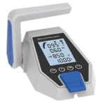
Evo Top Mount Control

You could always find a control that best fits your boat.