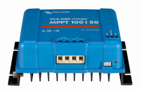
Solar charge controller MPPT 100/50