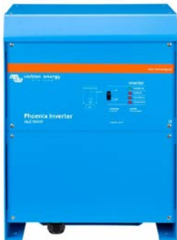
Phoenix Inverter 24/3000