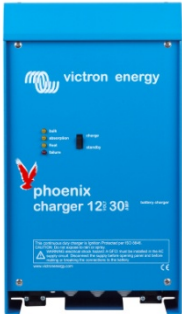
Phoenix Charger 12 V 30 A