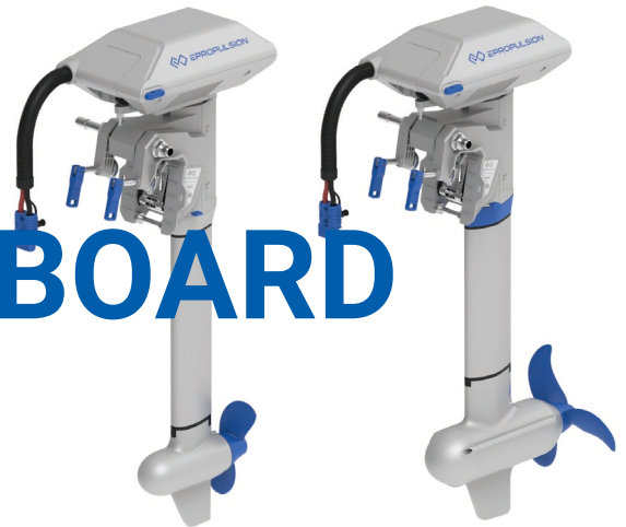
Navy 3.0 Evo / 6HP