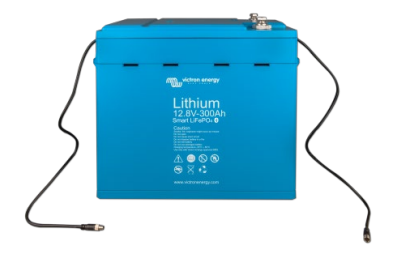
12,8V 300Ah LiFePO4 Battery

Very useful to localize a (potential) problem, such as cell imbalance.